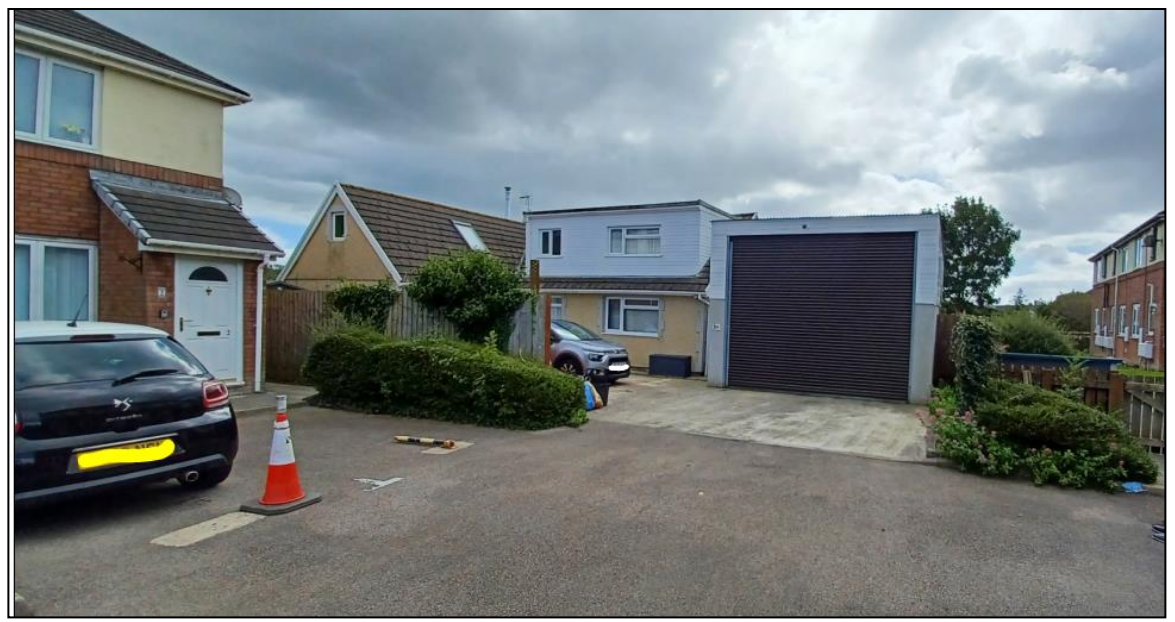
Figure 3 View of Front of Site from Greyfriars Court