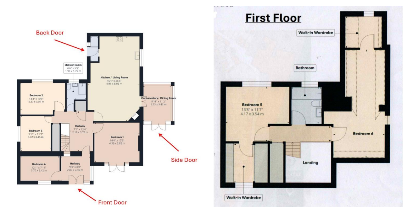
Figure 2 – Existing and Proposed Layout of the Building

The Application site comprises a two-storey detached dormer bungalow with rendered / pebble dash exterior walls and a pitched roof of interlocking concrete tiles. The site is set back some distance from Coity Road along an access way (approximately 85 metres in length) which also serves properties in Greyfriars Court