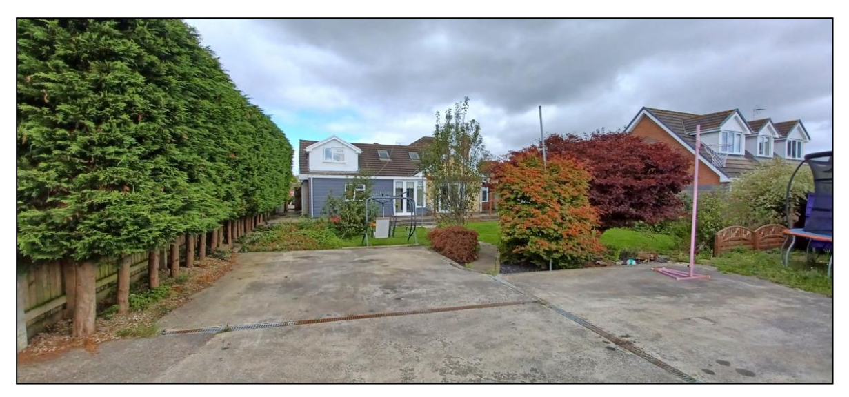
Figure 5 Rear Elevation of Application Dwelling