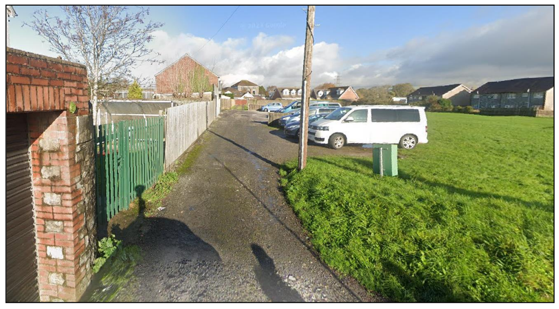
Figure 8 View of Access Way Leading to The Rear Of The Site