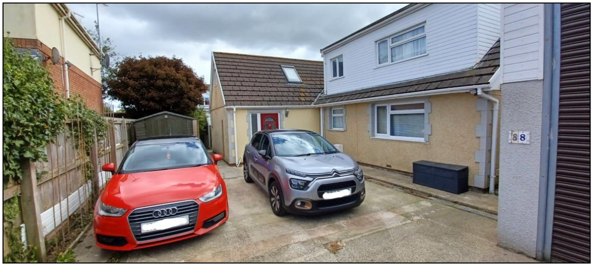
Figure 4 View of Front of Site Showing Existing Parking Area