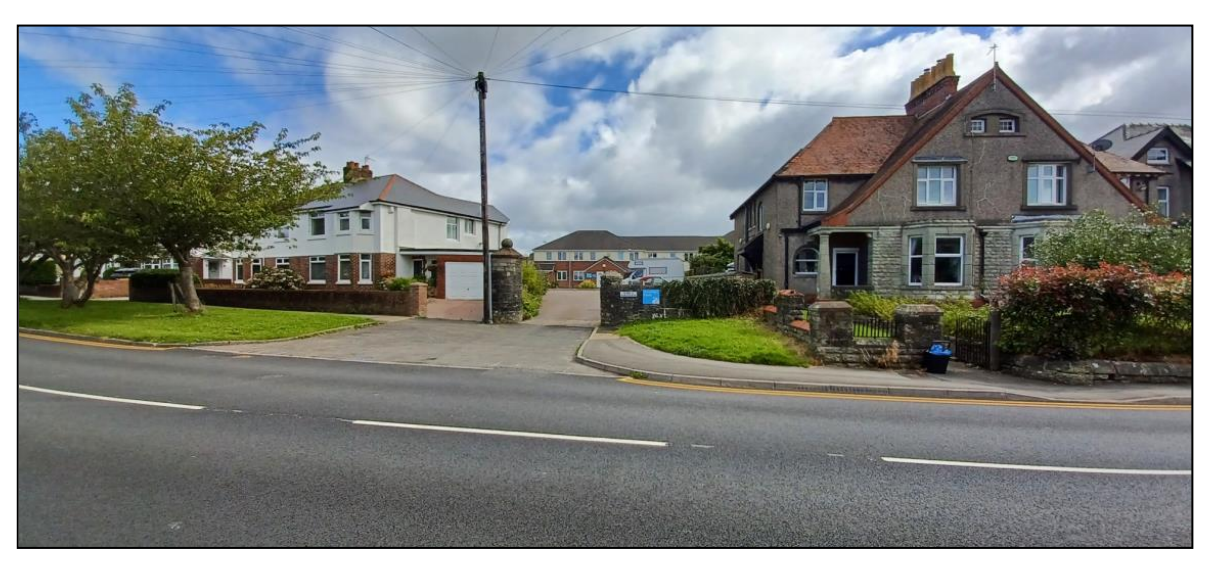
Figure 7 View of Access Way Leading to The Site Where It Adjoins Coity Road