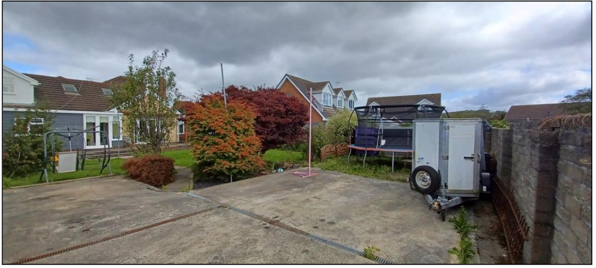
Figure 6 Rear Elevation of Application Dwelling Looking East